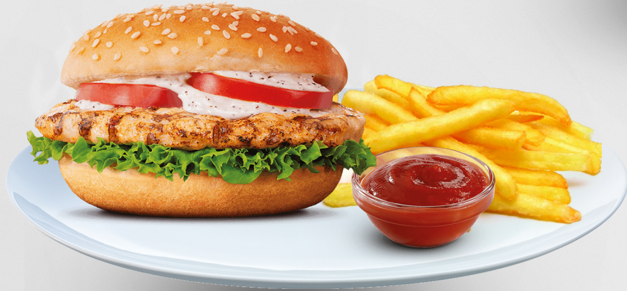
CHICKEN - LAMB BURGER