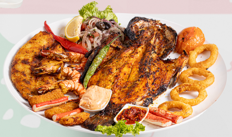
MEZZA PLATER COMBO