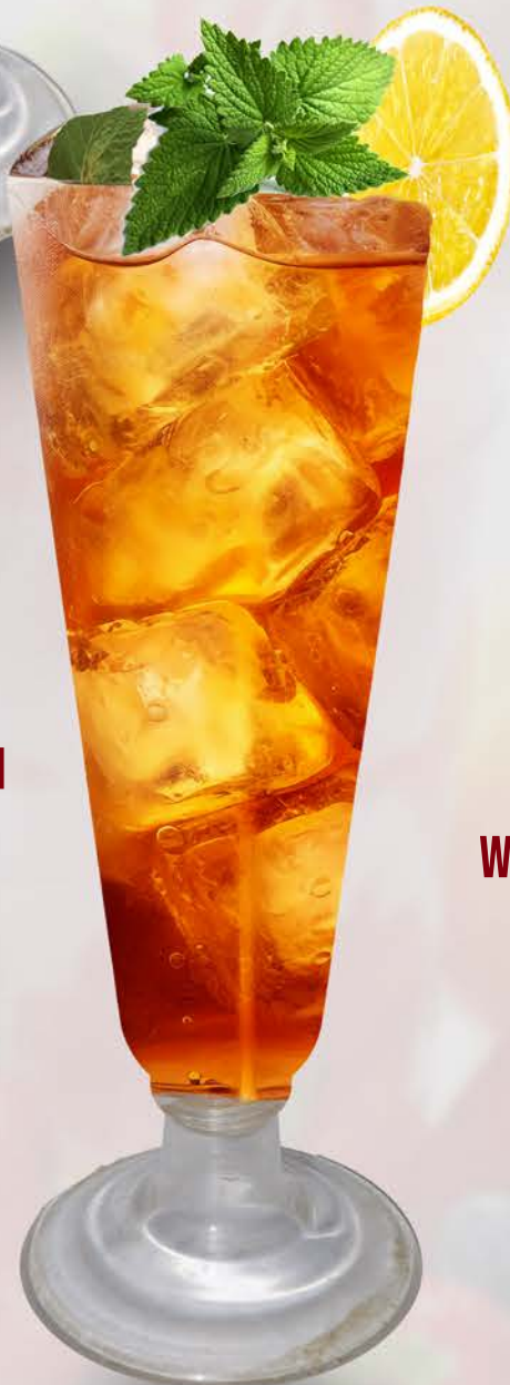
ICE LEMON TEA