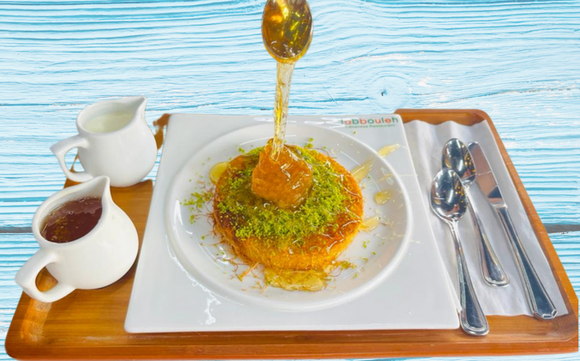
Kunafa with HoneyComb - $20.90