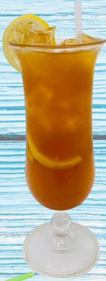
Ice Lemon tea