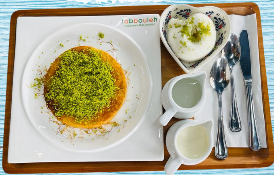
Kunafa with Goat milk ice cream- $20.90

All prices are subject to 10% service charge.